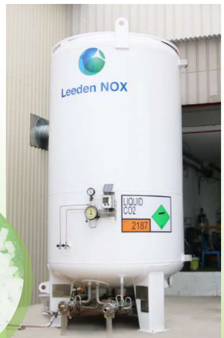
Liquid CO 2 Tank

To enquiry, please reach out to sgsales.gas@leedennox.com .